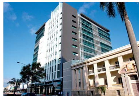
LEFT: Townsville's newest commercial landmark is the first building in Australia to target all available office ecologically sustainable development (ESD) ratings.

Verde's Flinders Street Tower will house a number of State Government departments.