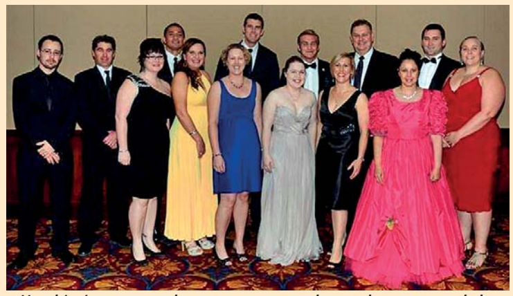
Hutchies' team members were among those who supported the BIRU Fundraising Ball.

The $8.4 million project will have 2,800 square metres of