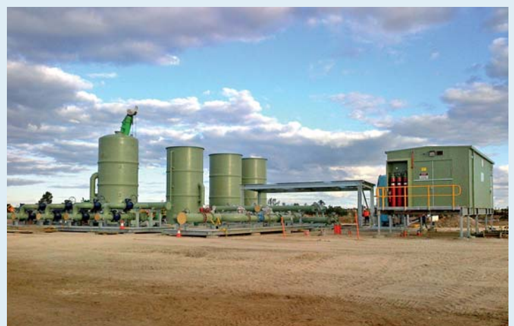
Tanks are now in place at the water gathering station project at Condabri Central in the Surat Basin.