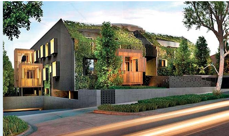
Artist's impression of the Averı Apartments project currently under construction.

Job Description: Proposed new pool covering an area of 175m 2 is currently being constructed adjacent to the resort's existing pool. The construction area is currently a freshwater pond, bounded by a natural wetland which buffers the site from Weyba Creek. Dewatering operations have the potential to impact the surrounding environment if not