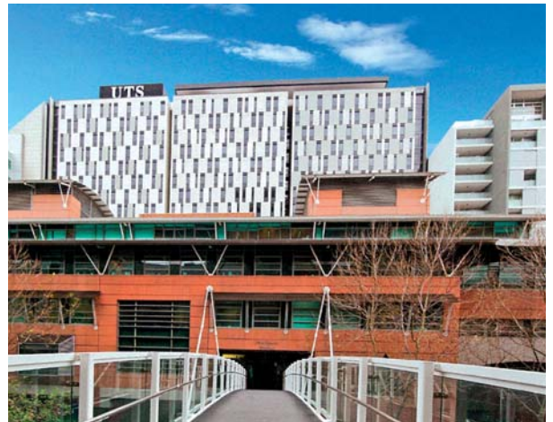
Award-winning student accommodation at the Sydney University of Technology.