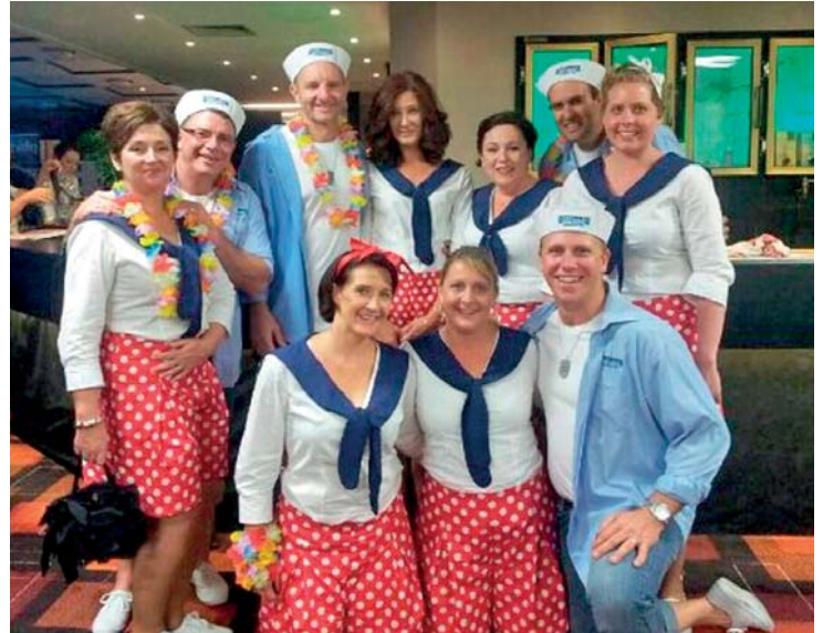
The Toowoomba team attended the Toowoomba Business Excellence Awards dinner with a South Pacific theme, winning Best Dressed table.

THE Tweed team attended the MBA Northern NSW Region – Building Industry Awards where they won the Best Commercial Project – Sporting Facilities – with Surfing Australia High Performance Centre at Casuarina Beach.