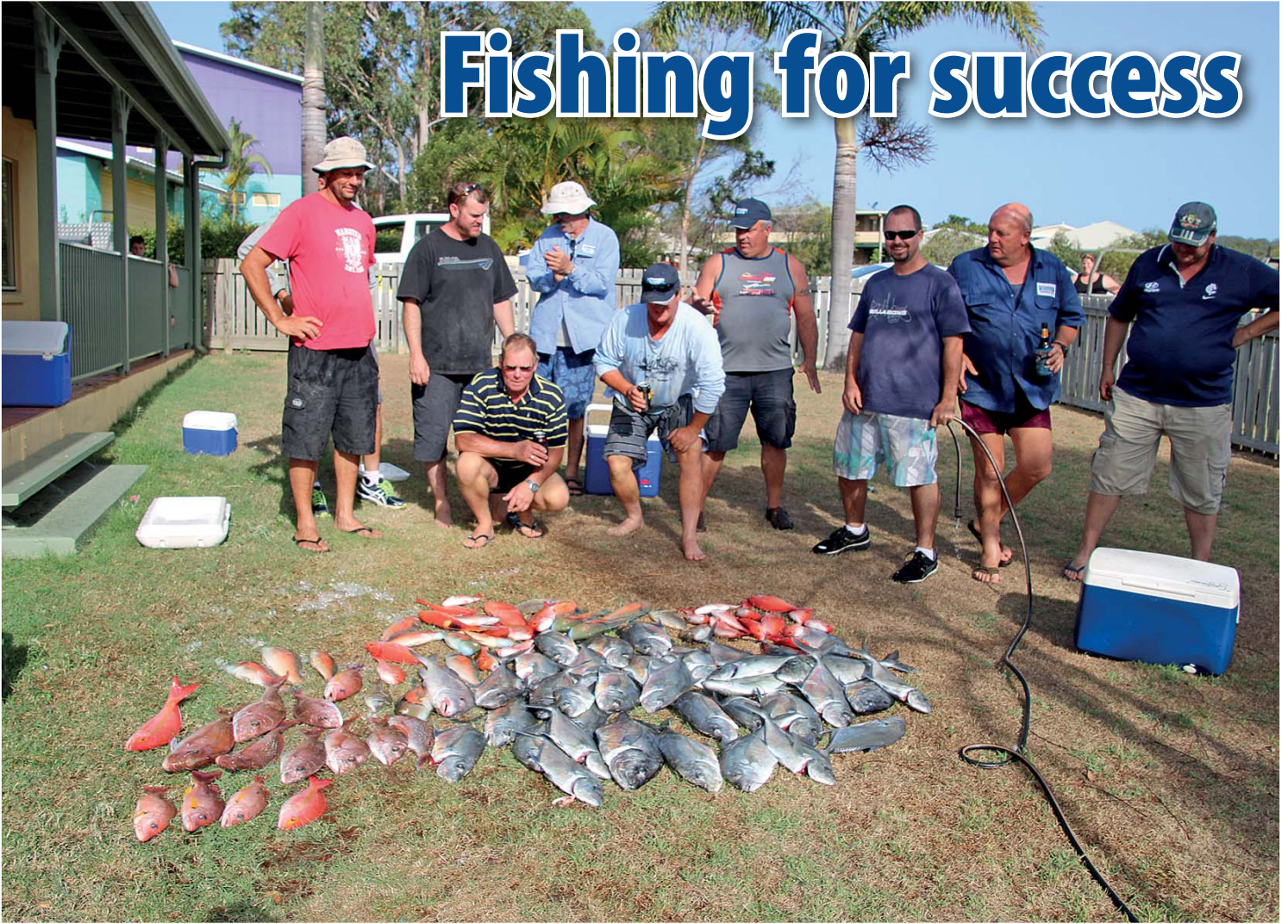
Members of the Hutchies' fishing trip to Rainbow Beach survey the fruits of their labour. They came home with tans, good memories and, surprisingly, a good haul of fish.