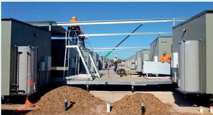
Turinga Village is a 200-man temporary and semi-permanent accommodation camp under construction in the Surat Basin.

Structural Engineering Consult: LCJ Engineers Client: . . . . . Redcape Hotel Group