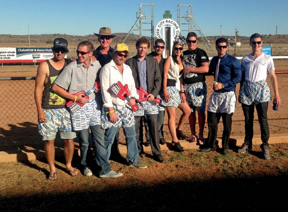
Hutchies team members and subbies were strong contenders for "fashions on the field" at the Broken Hill race day.

IT was fashions on the field with a twist when Hutchies' team members and subbies enjoyed a day at the races in Broken Hill.