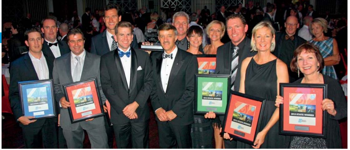
Hutchies' Sunshine Coast team excelled at the MBA Sunshine Coast Awards.

Hutchies took out awards for Buderim Hospital – Health & Education Facilities over $20 million (Maroochydhore team); Elysium Recreation Centre –