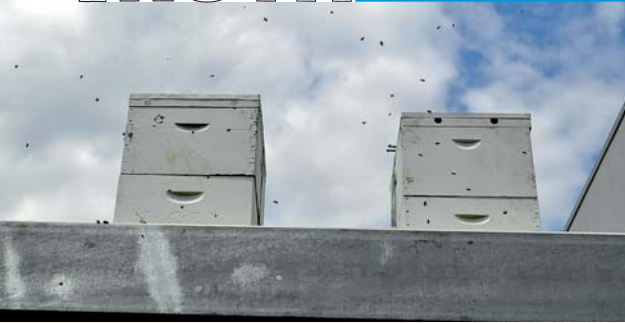
Hutchies' bees enjoying their new rooftop hives with a view.