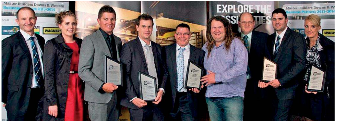
Hutchies' Toowoomba team at the MBA Downs and Western Housing and Construction Awards night.