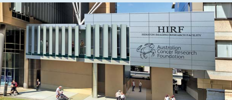
Artist's impression of the $5 million Herston Imaging Research Facility.