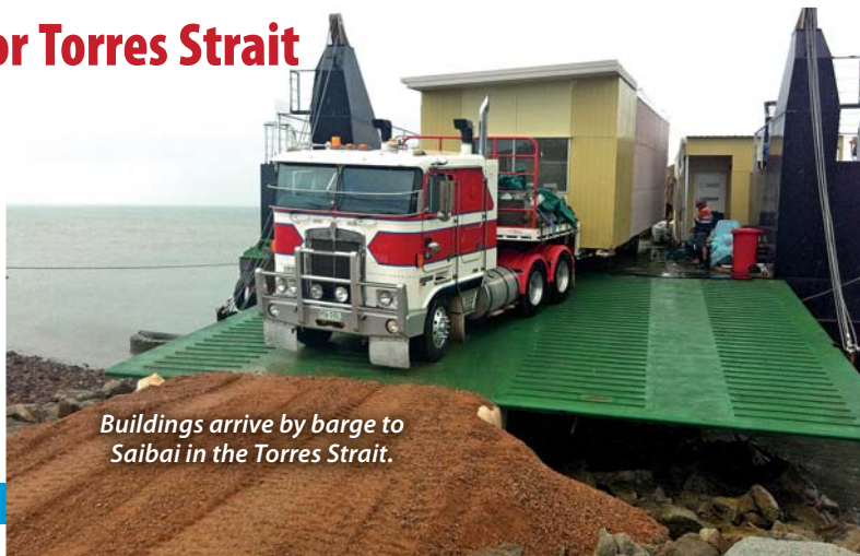
Buildings arrive by barge to Saibai in the Torres Strait.

Rapid construction of the two and three-bedroom accommodation facility was achieved with delivery of a Hutchies-built transportable buildings to the island by barge.