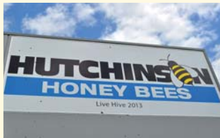
Hutchies will be jarring its own honey soon.

Sourced through The Downtown Honey Co, Hutchies' hives are proving popular with their busy occupants which seem more than content with their new homes' rooftop views.