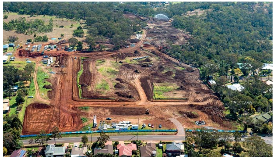
Aerial views of Sanctuary Rise (above) and Casuarina Town Centre (left).

ACTIVITY in Hutchies' civil works program took a strong upwards spike with the inclusion of two new major projects with a combined value of almost $15 million.