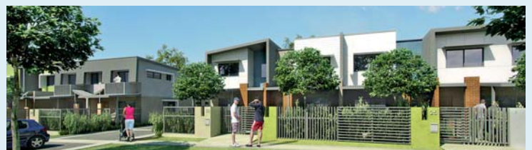
Artist's impression of stage one of the Cornerstone Living project under construction in Coopers Plains, Brisbane.