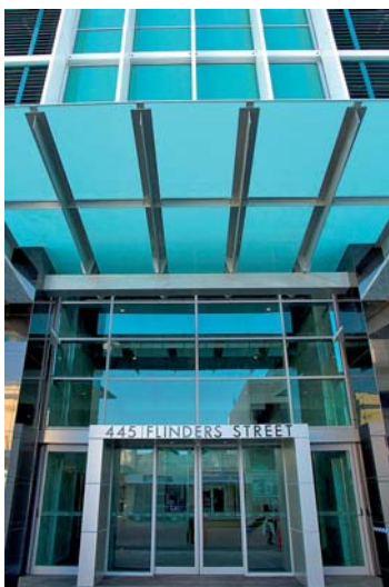
Verde's Flinders Street Tower will house a number of State Government departments.